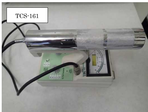
Figure 5. NaI (Tl) scintillation survey meter