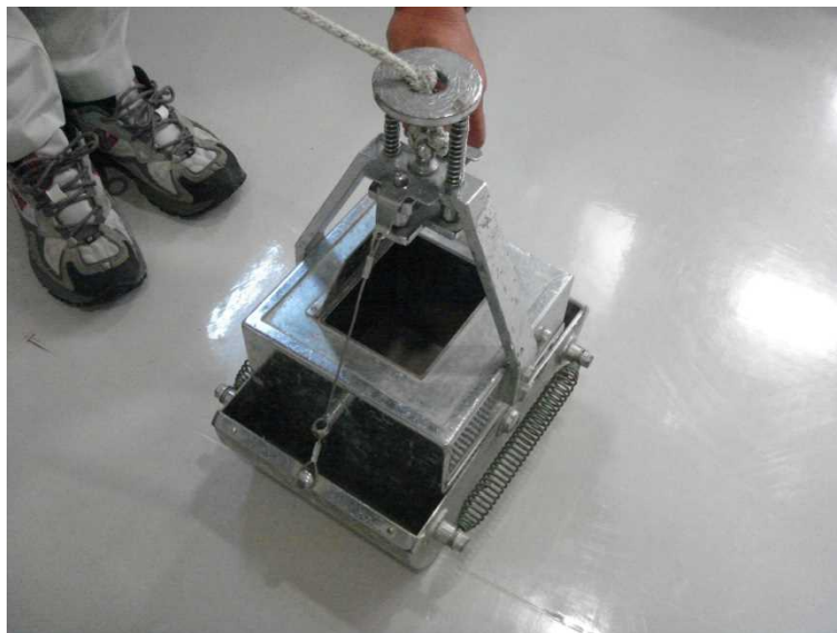
Figure 2. Ekman-Birge bottom sampler

■ Field observation items : Sampling depth, properties, color, sediment temperature, odor