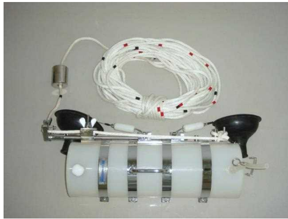
Figure 7. Van Dorn sampler

■ Field observation items : Water depth, sampling depth, water temperature, color, odor, secchi disk depth, electrical conductivity