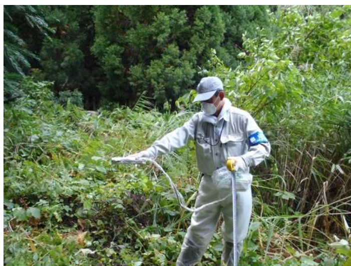
Figure 6. Measurement of ambient dose rates (example)