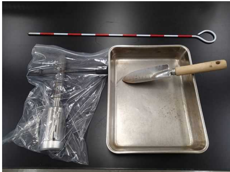
Figure 3. Soil sampler kit.

■ Field observation items : Properties, color, odor