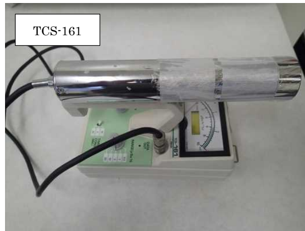
Figure 5. NaI (Tl) scintillation survey meter