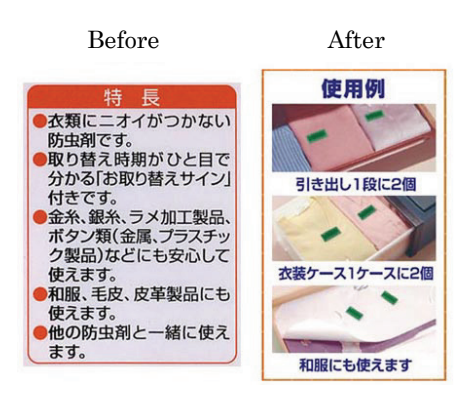
Figure 55 Changing the label on a mothball product