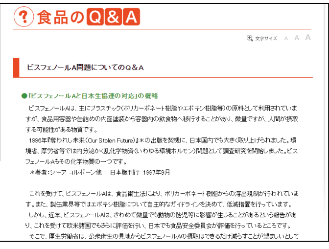
Figure 52 Q&A on the bisphenol A issue

This webpage provides information on chemical substances in food, food additives, and packaging. The information thus provided is classified by theme and issue. For each substance, the webpage explains a number of aspects--ranging from the uses, exposure pathway, and safety to the background to the substance having attracted social attention, as well as what consumers should be cautious about--in a way that is easy to understand for those with no special knowledge.