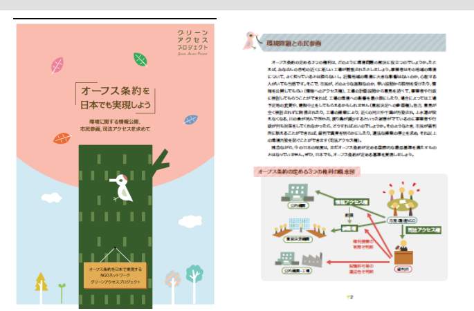
Figure 51 Pamphlet on the Aarhus Convention

Aarhus Net Japan has produced the pamphlet shown in Figure 1 and distributed copies of it as part of its information campaign.