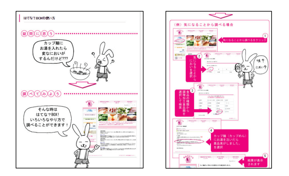
Figure 54 How to use "Q&A on food in general"

This webpage is aimed at facilitating communication on food in general. It provides information by answering questions frequently asked by consumer members. The page is designed for consumers to readily find the information they need. For example, the information is organized according to "what's on your mind" (agricultural chemicals, labeling, how to use, etc.) and "food type." It allows them to deepen their understanding about food on their own accord.