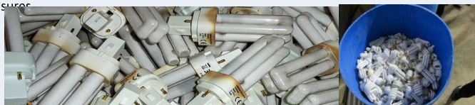
Website of UNEP

Article 11 of the Minamata Convention on Mercury requires each Party to take appropriate measures so that mercury waste is managed in an environmentally sound manner. Mercury contained in used products (waste mercury-added products) such as fluorescent lamps and batteries need to be recovered to the extent possible, in order to prevent contamination of the environment from improper handling of these products. However, mercury is an element, and unlike other organic pollutants cannot be treated easily with conventional treatment measures.