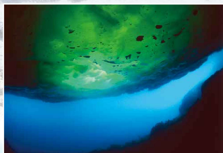
Sea ice seen from the bottom

The coastal areas of Shiretoko in the Sea of Okhotsk are located in the lowest latitude in the world where sea ice can form. The formation of sea ice promotes upwards and downwards convection in the ocean water by cooling the surface layer of ocean water, which raises the nutritive salts that accumulate at the lower levels of the sea up to the surface level. Once spring arrives, the surface layer is bathed in enough sunlight for photosynthesis, and phytoplankton proliferates explosively using nutritive salts. The vast quantities of plankton produced in this way form the starting point for the food chain that sustains the rich ecosystems of Shiretoko, linking the ocean, rivers and forests.