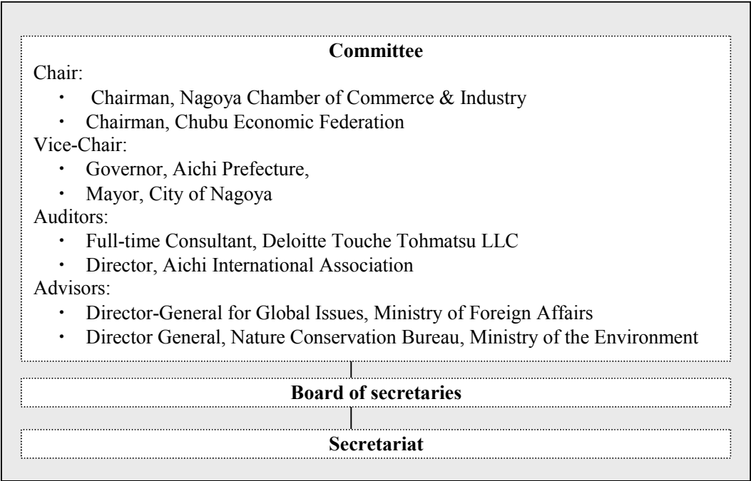
Table2.2 Organizational structure of the Aichi-Nagoya COP10 CBD Promotion committee