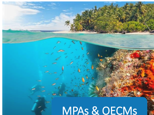
MPAs & OECMs

29 proposals received 7 shortlisted 3 selected