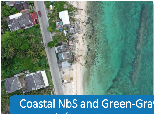
Coastal NbS and Green-Gray Infrastructure

29 proposals received 7 shortlisted 3 selected