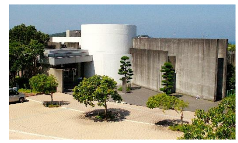
Minamata Disease Municipal Museum

Number of visitors to the Minamata Disease Municipal Museum 42,935 in FY 2018, 38,533 in FY 2019, 2,671 in FY 2020, and 9,722 in FY 2021