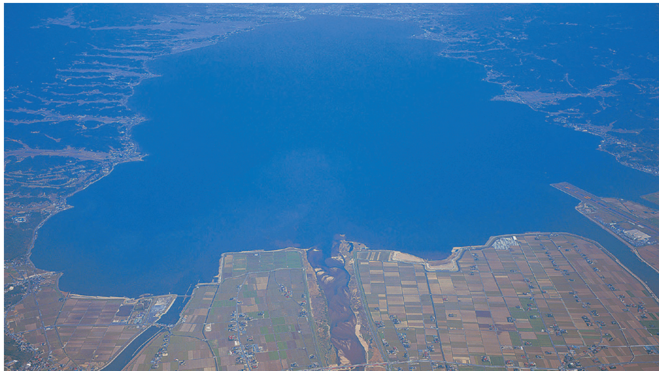
Shinji-ko from the west

Geographical Coordinates: 35°26'N, 132°57'E / Altitude: 0.3m / Area: 7,652ha / Major Type of Wetland: Brackish lake / Designation: Special Protection Area of National Wildlife Protection Area / Municipalities Involved: Matsue City and Izumo City, Shimane Prefecture / Ramsar Designation: November 2005 / Ramsar Criteria: 5, 6, 7, 8