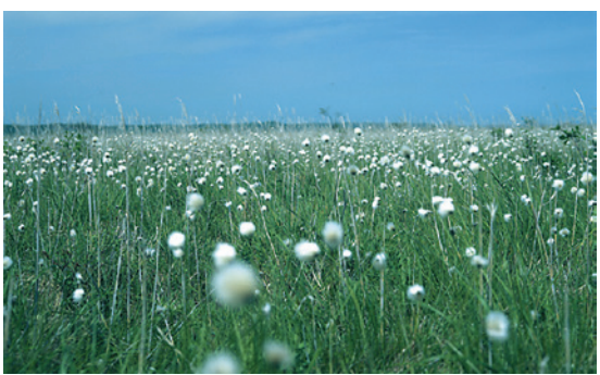
Hare's Tail Cotton Grass