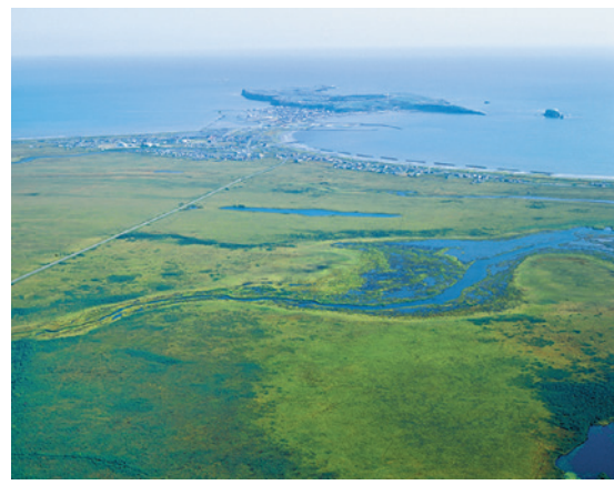
Aerial view of Kiritappu-shitsugen