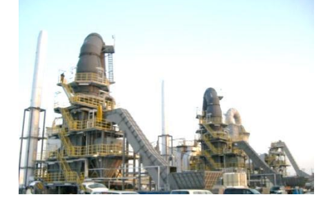
Temporary incinerator in Souma city. Fukushima