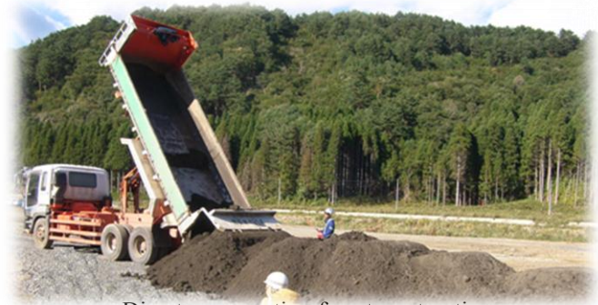
Disaster prevention forests restoration (Settai region, Miyako city, Iwate, started from October, 2012)

Conversion factor (t/m^3) : Concrete debris (2.35), Tsunami deposit (1.8) Unit: 10 thousand ton)