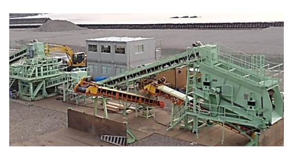
Treatment facility of tsunami deposit in Kamaishi city, Iwate prefecture (Installed on March, 2013)