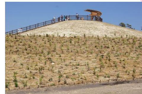
Millennium hope hills project in Iwanuma city, Miyagi prefecture (Completed on June 9, 2013)