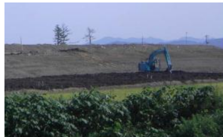
The city park restoration work in Noda village (Iwate).