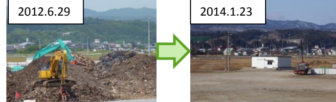
The temporary storage site clearing progress (Noda village, Iwate Prefecture)

Major public works projects using materials recycled from debris and tsunami deposits