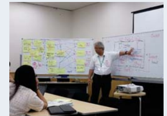
Training Programme in Tokyo, Japan (2019)

Japanese experts have shared their know-how and experiences in developing the MMF at a series of workshops organized by MOEJ for ten partner countries. Since 2019, stakeholders from some countries have been invited to participate in a training workshop to develop the MMF. The next step would be consultation with the stakeholders to obtain useful information such as monitoring data and reports published by international organizations for the partner countries.