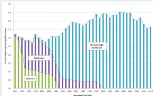
Source: "Lessons from Minamata Disease and Mercury Management in Japan (Ministry of the Environment, Japan) https://www.env.go.jp/chemi/tmms/pr-m/mat01/en_full.pdf