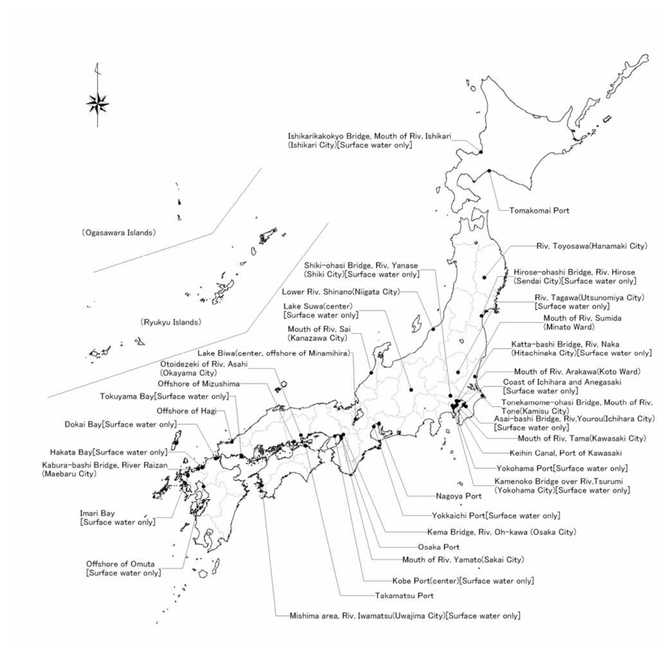
Figure 1-1-1 Surveyed sites (surface water and sediment) in the Initial Environmental Survey in FY 2009