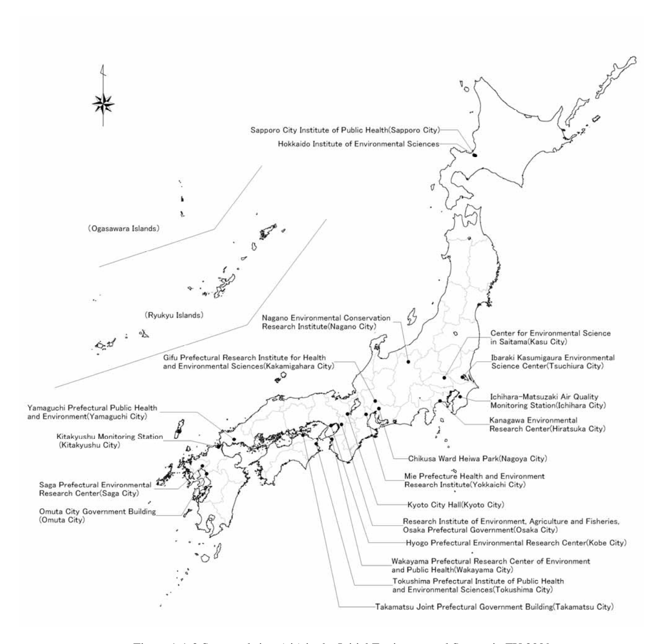
Figure 1-1-2 Surveyed sites (air) in the Initial Environmental Survey in FY 2009