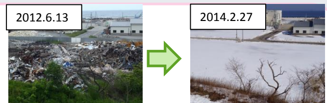
The temporary storage site clearing progress (Hirono town, Iwate Prefecture)

Major public works projects using materials recycled from debris and tsunami deposits