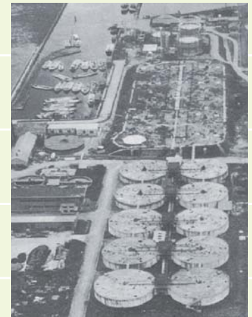
Picture 1 The first large scale night soil treatment plant (Sunamachi plant, capacity 3,600kℓ/day,1954) (6)