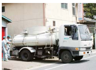
A normal vacuum truck