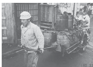
A two-wheeled cart in 1950s (6)