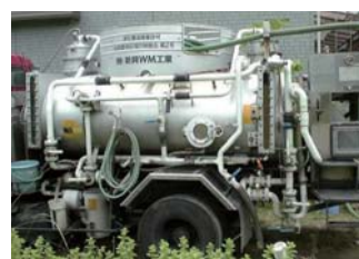
A vacuum truck with concentrating function