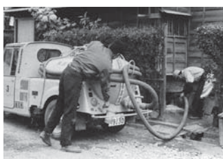
The first small vacuum truck in 1960s (6)