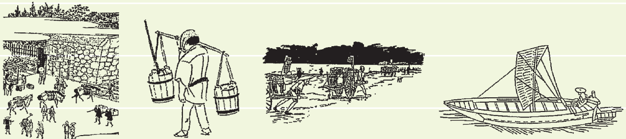
Figure 2 The landscape of night soil transportation in the Edo Era (1)