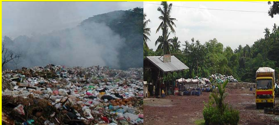
No more burning at the dumpsite