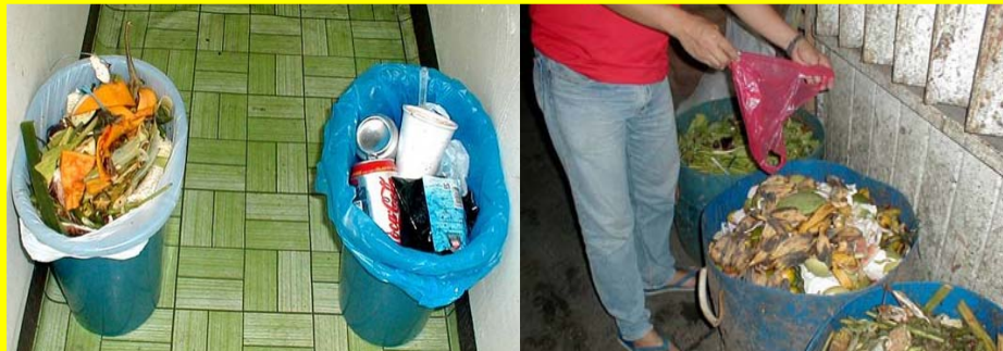
Increased awareness and participation of the community in segregation and proper waste management