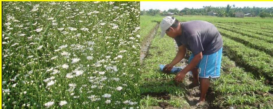
Utilization of Compost from biodegradable waste