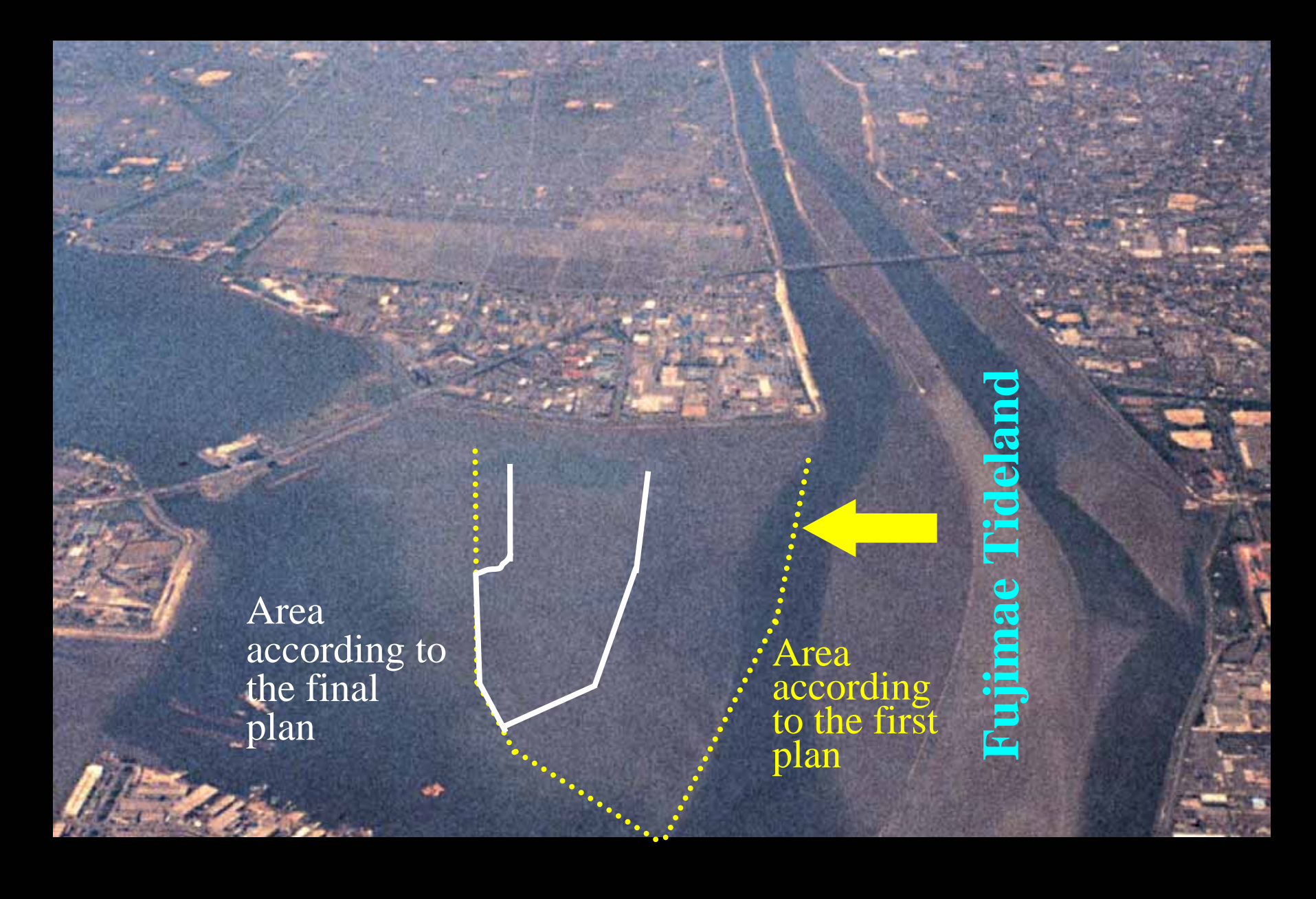
Fujimae Tideland and the area planned as landfill