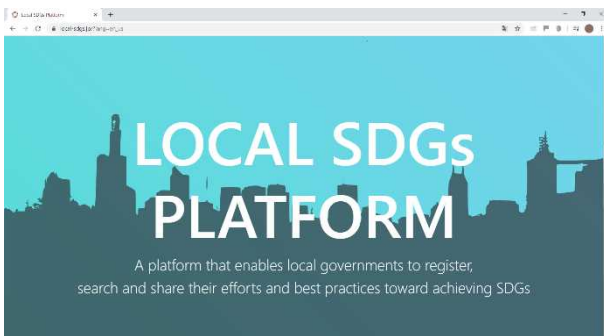
Fig. 1 Top page of the Local SDGs Platform.

The online "Local SDGs Platform" ( https://local-sdgs.jp/?lang=en_us ), which enables stakeholders to register, search for, and share their efforts and best practices toward achieving the SDGs, was developed after the local SDG indicators and local SDG databases had been developed. The platform enables assessment of a selected prefecture or municipality by calculating scores varying from 0 points (worst in Japan) to 100 points (best in Japan) based on the indicator values. The platform uses a simple geographic information system (GIS) so that the users can easily select their prefectures and municipalities of interest. The platform also generates radar charts that show the balance among the 17 goals of the SDGs. Users of the platform can also investigate which prefectures and municipalities have visions, strategies, policies and measures that incorporate SDGs as well as examples of practices regarding local SDG initiatives.