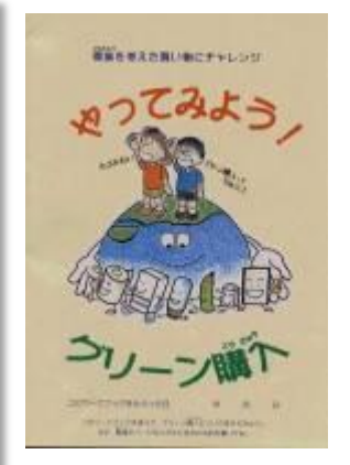
Booklet for environmental education