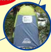
↑ Midori-numa Pond disposable toilet booth

Please start hiking between 7:00 and 13:00. Please obey the Center staff's instructions with regard to the return time limit.