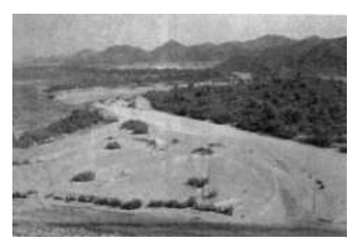
The floodplain forest of Hoarusib river From Mifuyu Yoshida "Himba and Desert elephant" (1)

The Namibian climate features increasing rainfall from the coastal region through to the north-east, and changing landscape from desert through to steps and savannah. The insufficient rainfall in the Namib desert region on the coast makes agriculture impossible. In the region with average yearly rainfall less than 250mm, there are only sparse grasses and shrubs; goats and sheep are raised there. The region with 250-400mm rainfall per year sees a shift from farming of small animals to cattle <sup>(2)</sup>. The area covered by this study is located around the seasonal Hoarusib river in the Kunene region of north-western Namibia, settled by the Himba tribe.