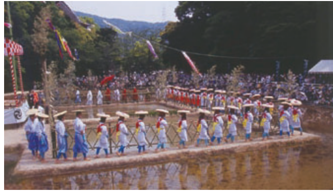
Celebrating the transplanting of the rice seedlings -Shimonoseki City, Yamaguchi prefecture

Ver the centuries, ecosystem services provided by the Satoyama Landscape have inspired a rich tradition of community-based performing arts and artistic culture. These blessings of nature are never taken for granted. The people always express their prayers and gratitude for abundant water, favorable weather and good harvests at various festivals and ceremonies held throughout the year. These annual lifestyle rhythms, which are embedded so deeply in the Japanese psyche, are vanishing from the cities, but are still observed in the Satoyama rural regions.