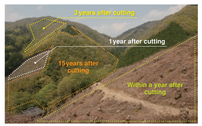
Oak coppice in Hyogo Prefecture, Japan

Sustainable resource management and land use strategies must be designed at an appropriate scale, taking into account the environmental capacity and natural resilience in each individual target region. Ignoring these vital factors can result in exhaustion of local wood and water resources, soil deterioration and erosion, and general loss of biodiversity and ecosystem services. The concepts of eco-agriculture, agro-forestry and rotating land use should be essential elements in the strategies, along with establishment and monitoring of environmental indicators. A good example is oak coppicing for charcoal manufacture in Hyogo Prefecture, where swaths of trees in various stages of regeneration are mixed together in a mosaic pattern. Each swath provides a slightly different natural environment, offering rich habitats for diverse species.