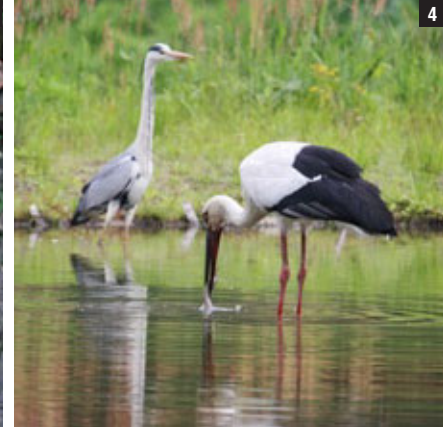
The Satoyama Landscape creates habitats that various species of plant and animal have learned to take advantage of, allowing a rich biodiversity to coexist in harmony with agricultural production. Rice paddies play an internationally important role in biodiversity conservation, serving as stopover wetland habitat for migratory shorebirds such as Golden Plover.