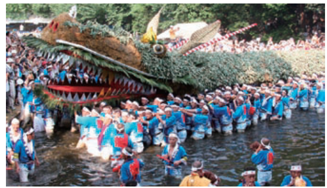
Rain Festival -Tsurugashima City, Saitama Prefecture

Terraced rice paddies in Nagaoka-City, Niigata Prefecture