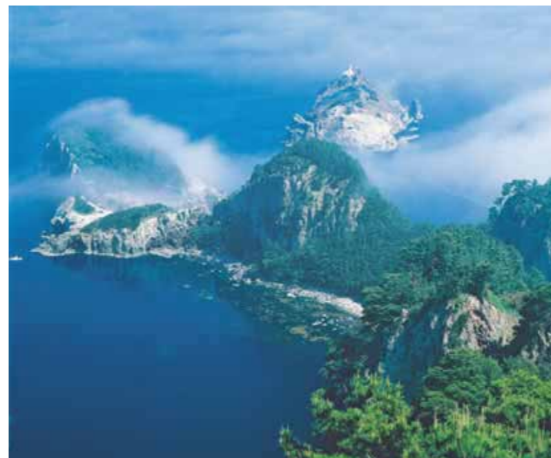
A cape in a sea mist, Okino-shima Island (Daisen-Oki NP) (4)