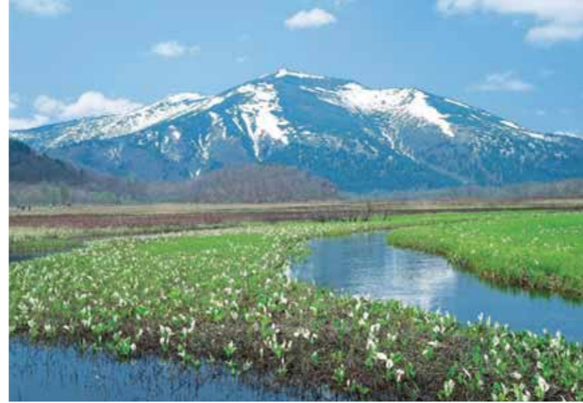
Asian skunk cabbage in Oze Marsh (Oze NP) (2) Wild azaleas and the Kuju Mountain Range (Aso-Kuju NP) (3)