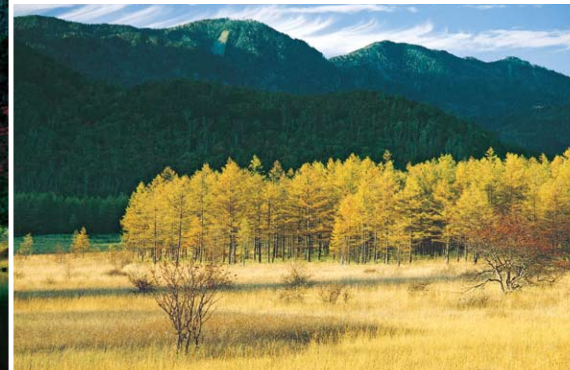
Kusa-momiji (Grass autumn color) and Japanese larch trees (Nikko NP) (3)