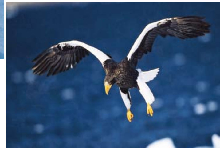
A messenger of winter: the Steller's sea eagle (Shiretoko NP) (4) Surging ice floe, with Kunashiri Island in the distance (Shiretoko NP) (5)