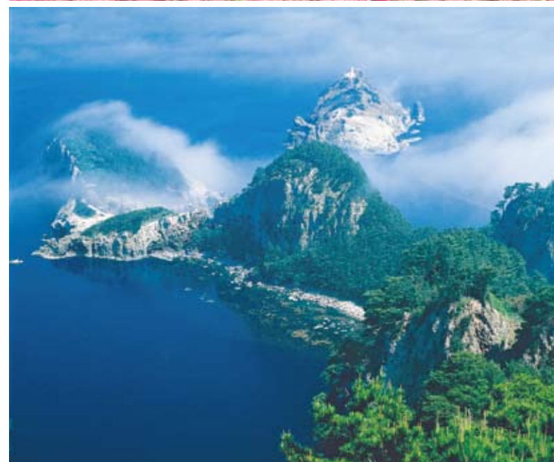
A cape in a sea mist, Okino-shima Island (Daisen-Oki NP) (4)