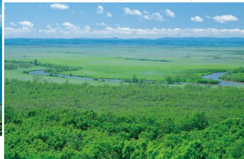
Kushiro River, flowing through the wetlands (Kushiroshitsugen NP) (4)