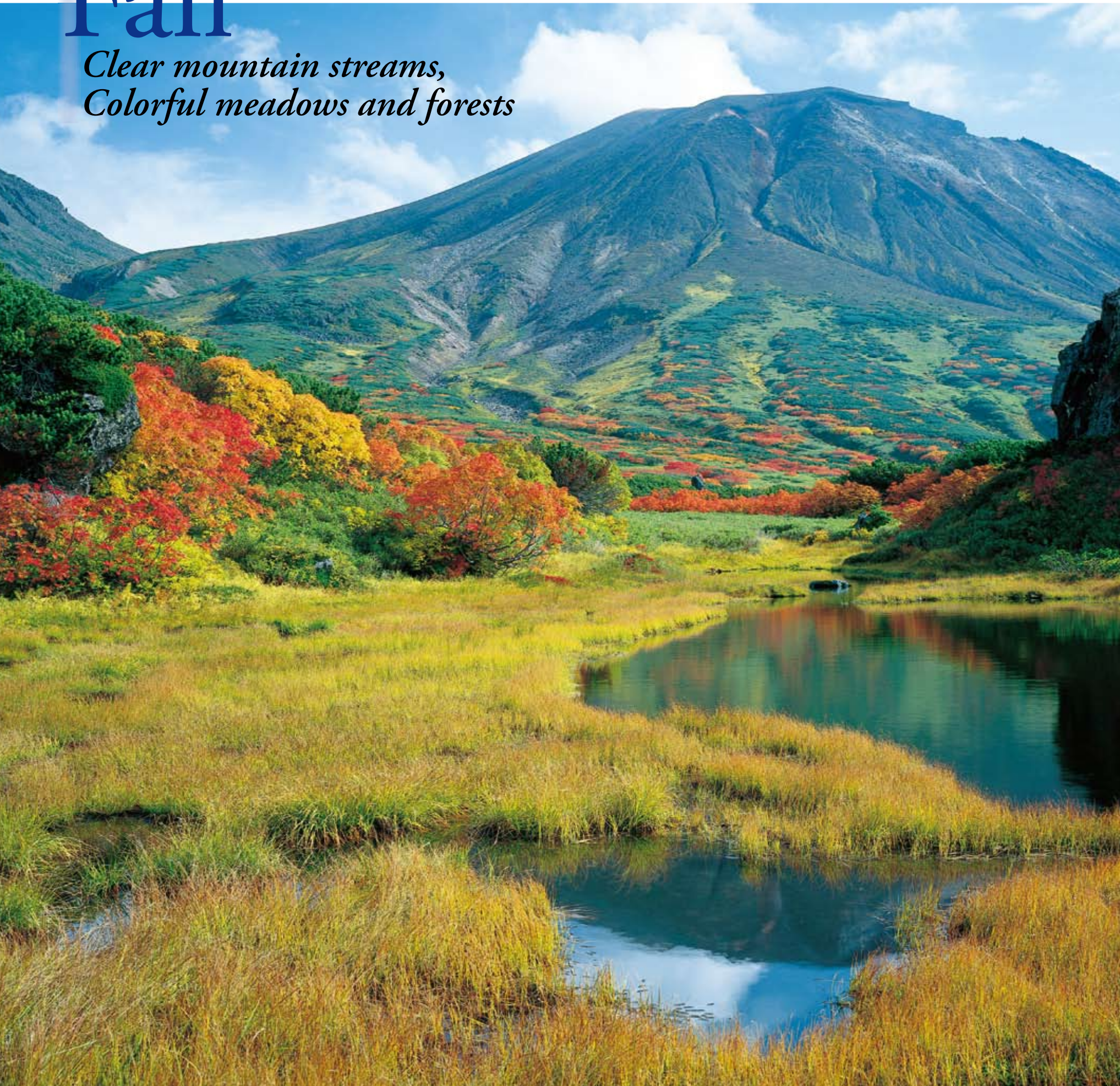
Mt. Asahidake, seen from mire pools in autumn color (Taisetsusan NP) (1)

Clear mountain streams, Colorful meadows and forests