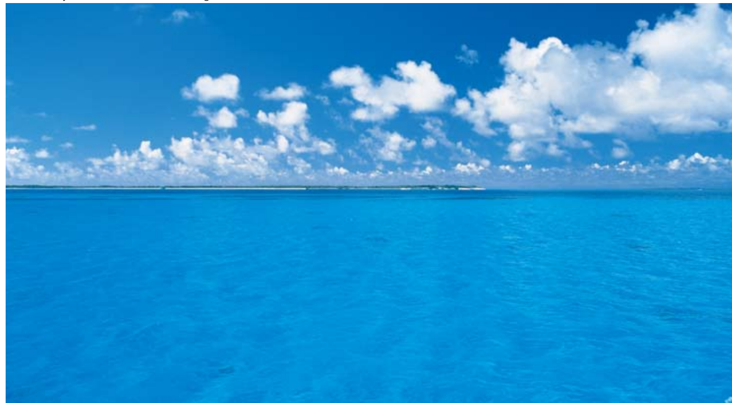
Islands of Yaeyama in the coral sea (Iriomote-Ishigaki NP) (5)