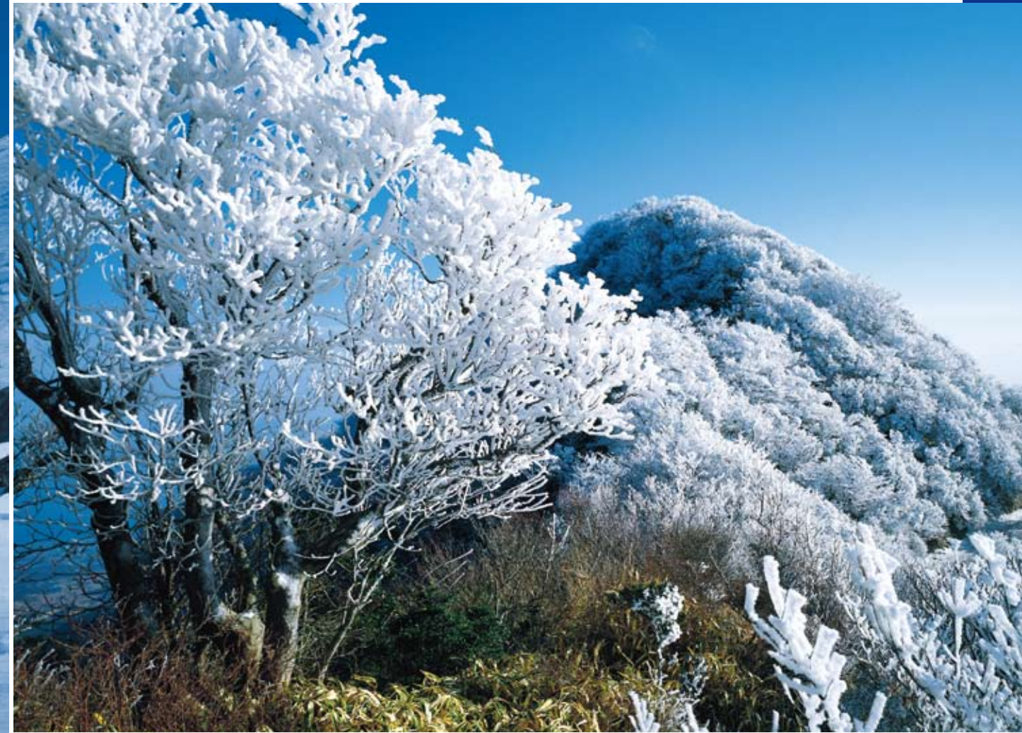
Hoar frost covered trees on Mt. Unzen-myoken-dake (Unzen-Amakusa NP) (3)