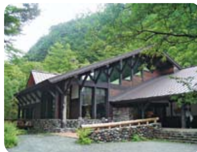
Kamikochi Visitor Center (Chubusangaku NP)

Visitor centers are the park facilities introducing special qualities of natural objects and processes in the park, to assist visitors to understand better and enjoy the park. Park visitors can learn about the park's scenic views and wildlife from the presentation of replicas, posters, diorama and videos. Real-time wildlife information, such as about blooming flowers and bear sightings, and information on the best hiking trails are also available. Use these free visitor centers to plan your activities and destinations in the National Parks.