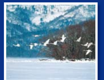
Whooper swans over Kussharo Lake (Akan NP)

Since ancient times, Japanese have sensed the beginning of a new season by bird migration. In late fall, mallard and swans fly from the north, spend winter in Japan and return to the north in spring. Other species, such as swallows and gray-faced-buzzard eagles, migrate from the south in early spring, and nurture juveniles in summer. Snipes and plovers visit the country both in spring and fall on the way to their final destinations. The National Parks play a vital role as habitats of these migratory birds and other wildlife.