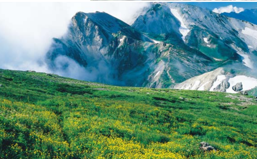
A flower carpet spreading over near the summit of Mt. Hakuba-dake, the Japan Northern Alps (Chubusangaku NP) (2)