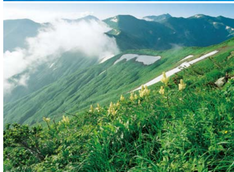
A flower garden on a major ridge of Asahi Mountain Range (Bandai-Asahi NP) (6)