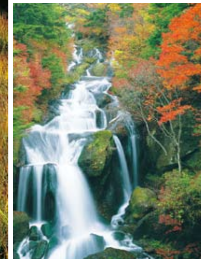
Autumn leaves and Ryuzuno-taki Fall (Nikko NP) (4)