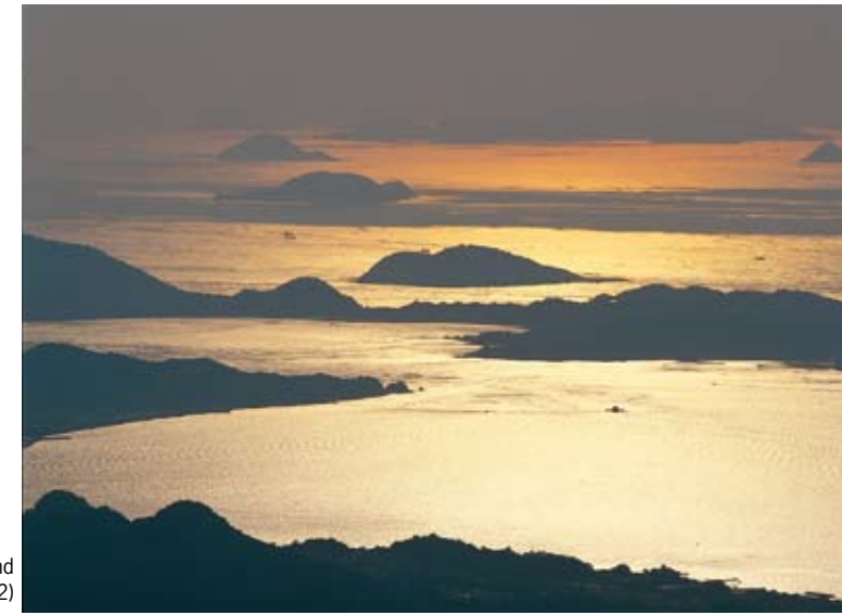
Autumn sunset at Setonaikai Inland Sea (Setonaikai NP) (2)