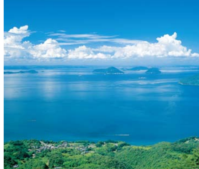
The summer of the archipelagic sea (Setonaikai NP) (3)