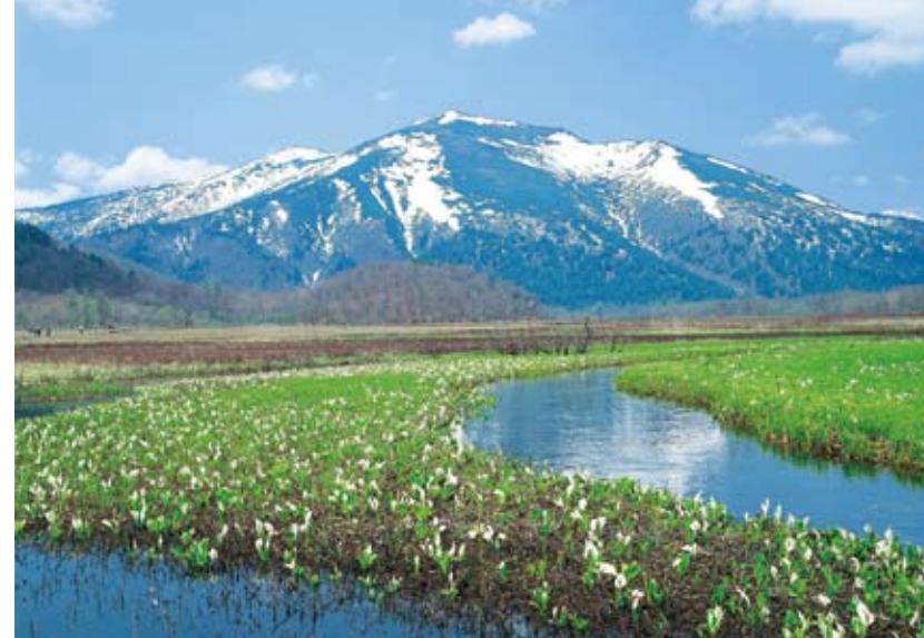
Asian skunk cabbage in Oze Marsh (Oze NP) (2) Wild azaleas and the Kuju Mountain Range (Aso-Kuju NP) (3)