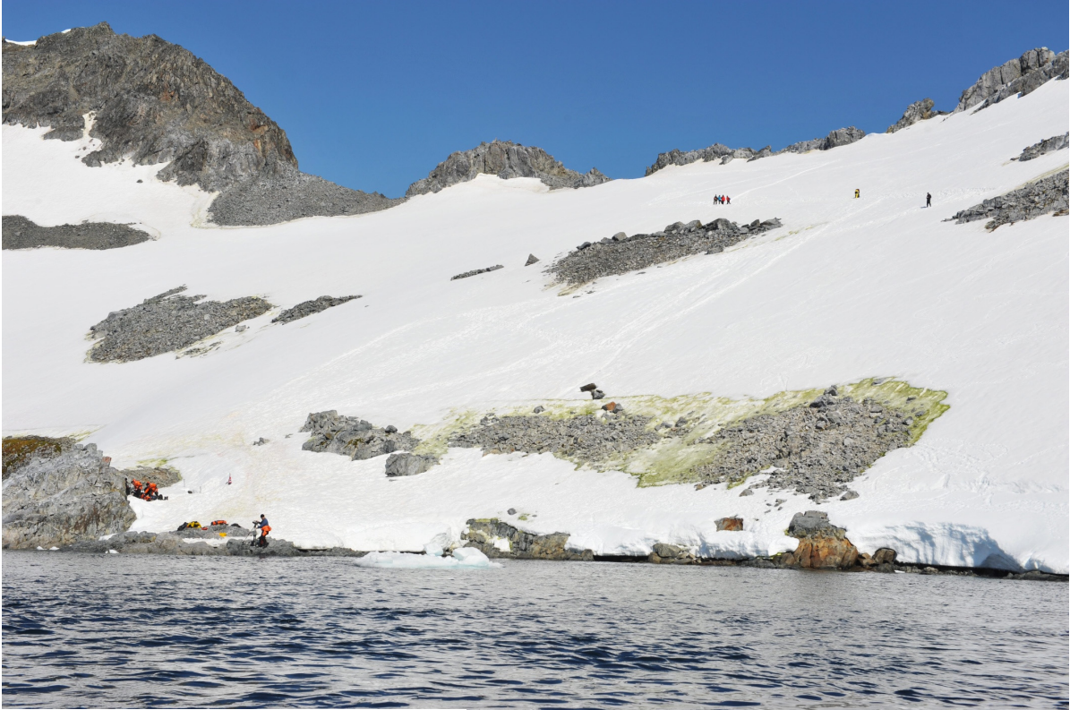
View of landing site (left hand side) and route to the ridge

*A ship is defined as a vessel which carries more than 12 passengers.