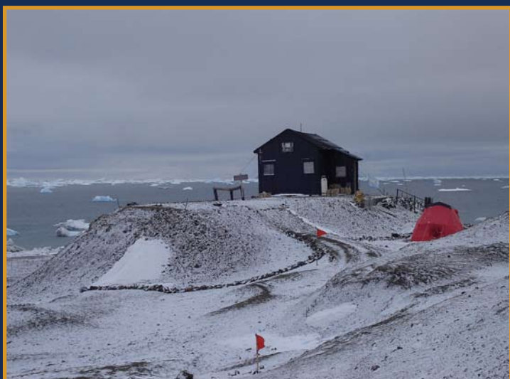
View of the hut and surrounding areas

Be extremely cautious when climbing the slope southeast of the hut.