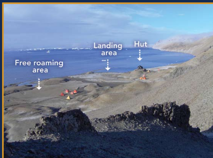
Details about the hut