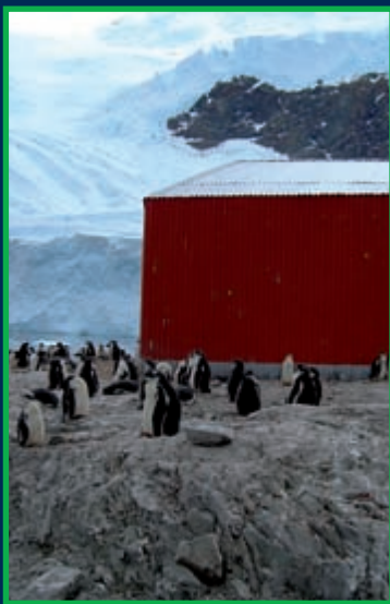
The refuge hut is slightly elevated above the beach, and often surrounded by nesting penguins