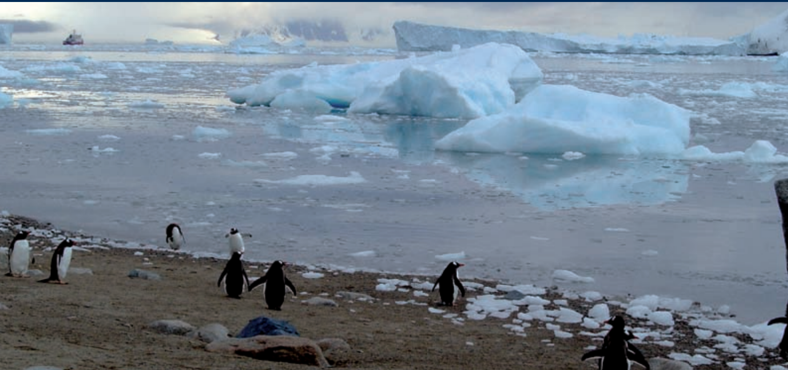
Neko Harbour landing beach