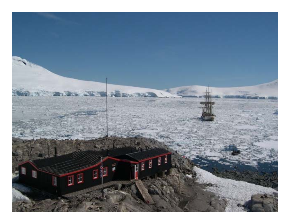
'Base A', Goudier Island, Port Lockroy

**It is the UK's policy to only allow visits from Government or IAATO Member vessels. Visitors enter the base at their own risk and neither the British Antarctic Survey, the United Kingdom Heritage Trust, nor the UK authorities will be liable for any personal injury or damage to property that may be sustained.