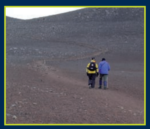
The path up Deacon Peak is clearly visible, particularly late in the season