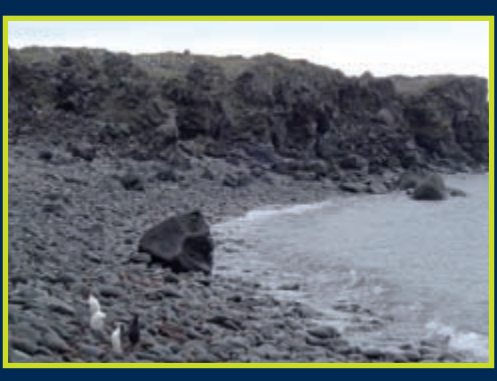
Landing site - be sure to stay clear of nesting giant petrels to the west