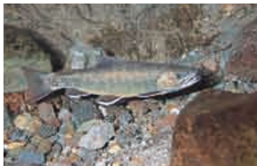
Dolly varden Salvelinus malma