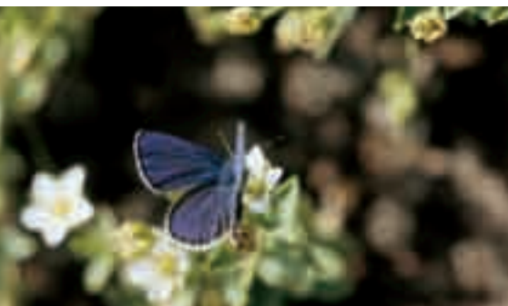
Vaciniina optilete daisetsuzaana (Natural monument)

Insects play an important role in transporting the nutrients of the ocean to the land. Aquatic insects such as stoneflies, sedges and midges form colonies and decompose the carcasses of salmon and trout after they have swum upstream and spawned (Ito and Nakajima, 2003). The nutrients from decomposed carcasses make river water and riverbank soils eutrophic, and enhance the growth of plants and other aquatic animals. In addition, the aquatic insects become the diet of fish in the river, thereby playing a major role in the food chain.