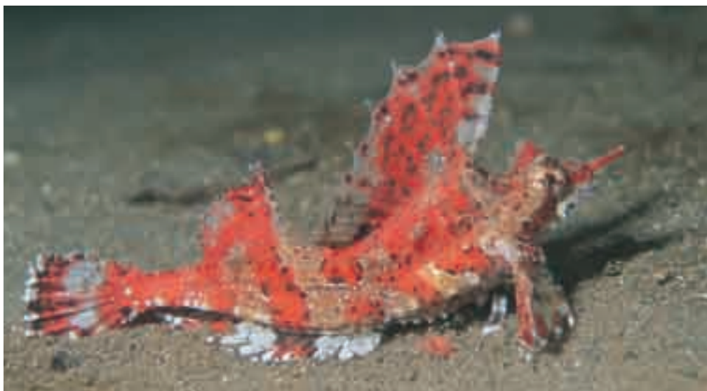
Hypsagonus proboscoidalis