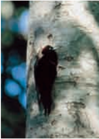
Black woodpecker Dryocopus martius

The vertical distribution of flora supports a wide range of birds, from montane species such as great tits Parus major and (Japanese) bush warblers Cettia diphone to alpine and subalpine species such as the (Eurasian) nutcracker Nucifraga caryocatactes , arctic warbler Phylloscopus borealis and red-flanked bushrobin Tarsiger cyanurus . Grassland birds such as stonechat Saxicola torquata , Siberian meadow bunting Enberiza cioedes , skylark Alauda arvensis can be seen in the grasslands at the tip and among the sand dunes at base of the peninsula as well as on the top of cliffs.