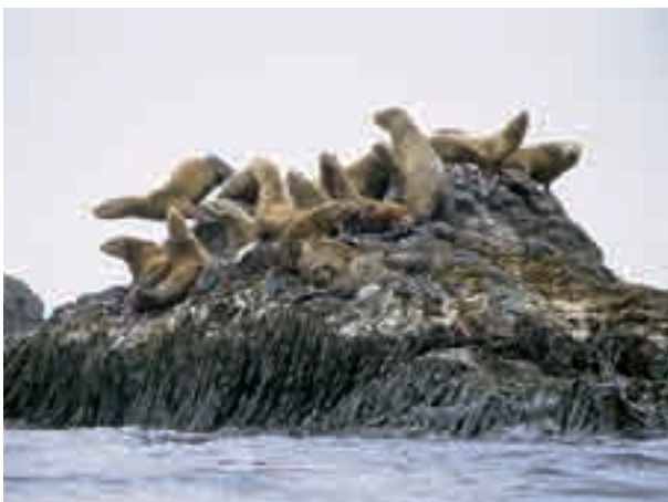
Pod of female Steller sea lions Eumetopias jubatus

The coastal waters of the Shiretoko Peninsula are an important breeding and feeding site for larga seals, ribbon seals and their pups. In particular, the area is the most southern habitat for ribbon seals. It is