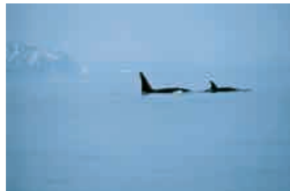
Killer whale Orcinus orca

Factors such as complex topography, diverse types of vegetation and the presence of seasonal sea ice around Shiretoko provide various habitats for birds and consequently, the avifauna of the Shiretoko Peninsula is rich in variety. In addition, due to the abundant food supply and virgin forests, the peninsula is an important wintering and breeding site for species such as Steller's sea eagle Haliaeetus pelagicus (VU, IUCN Red List), white-tailed eagle H. albicilla (LR, IUCN Red List), and Blakiston's fish-owl Ketupa blakistoni blakistoni (EN, IUCN Red List). In the nominated site, these three species and black woodpecker Dryocopus martius are designated as Natural Monuments (protected species, see 4c.5) due to their high scientific value identified.