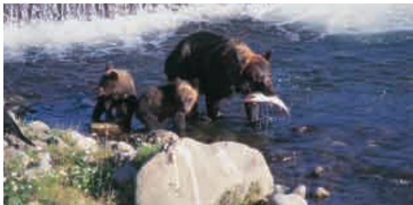
Brown bear Ursus arctos

The topography of the Shiretoko Peninsula is complex and there are various types of vegetation within a narrow range of altitudes from the coastline to the mountain peaks of approximately 1,600 meters above sea