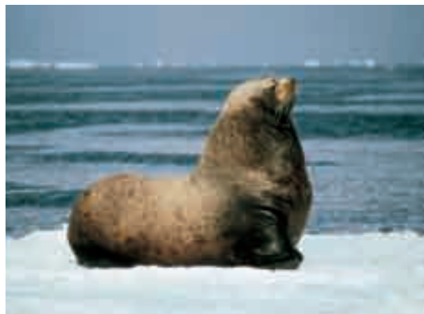
Male Steller sea lion Eumetopias jubatus