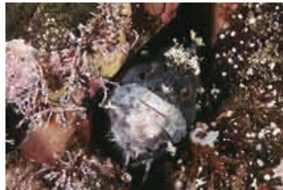
Fringed blenny Chirolophis japonicus

While approximately 70 percent of the total number of species consists of northern fishes which are mainly found in subarctic oceans, some 14 percent consists of species distributed over a wide range of climates and