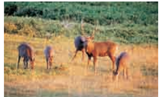
Yezo sika deer Cervus nippon yezoensis

The high densities of large mammals such as the brown bear and Yezo sika deer Cervus nippon yezoensis also indicate that the Shiretoko Peninsula is a high quality habitat for terrestrial mammals. The estimated density of brown bears in the Shiretoko Peninsula ranges from 7.3 to 14.1 bears per 100 square kilometers (Aoi, 1981) to an estimate suggesting a minimum of 35 bears per 100 square kilometers (Yamanaka et al. , 1995). These figures are comparable to those in Kamchatka (8.1 to 13.0 bears/100 km 2 ; Revenko, 1998) which is a high density area. Thus, the Shiretoko Peninsula has one of the densest populations of brown bears in the world. Furthermore, Yezo sika deer, a typical southern origin species (Nagata, 1999), is the largest subspecies of the sika deer C. nippon distributed from Vietnam to Far East Asia (Kaji, 1988). Its density is high in the Shiretoko Peninsula (Okada, 2000).