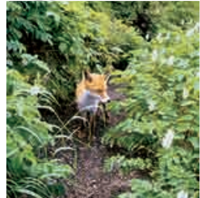
Red fox Vulpes vulpes schrencki

level. In addition, terrestrial mammals can utilize both the products from forests and sea. Thus, the potential food supply is diverse. For example, in autumn before the hibernation, brown bears Ursus arctos rely upon salmon and trout which swim upstream, in addition to nuts such as acorns. The bears' food items amount over 90 types of plant and animal materials. The population of red fox Vulpes vulpes schrencki in the area is unique in the sense that they rely on a larger amount of marine products such as fish (Tsukada, 1997). Overall, there is little human disturbance. Therefore, the Shiretoko Peninsula provides an untouched and rich habitat for terrestrial mammals. This is reflected in the home range size of the wildlife. Home range size tends to become smaller with the increase in quality of the habitat. The home range of adult female of brown bears in the Shiretoko Peninsula is a mere 15 square kilometers on average and it is one of the smallest in the world (Table 3-1).