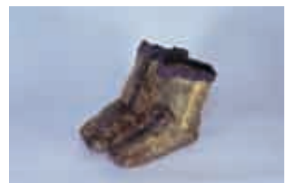
Traditional Ainu boots made from salmon skin