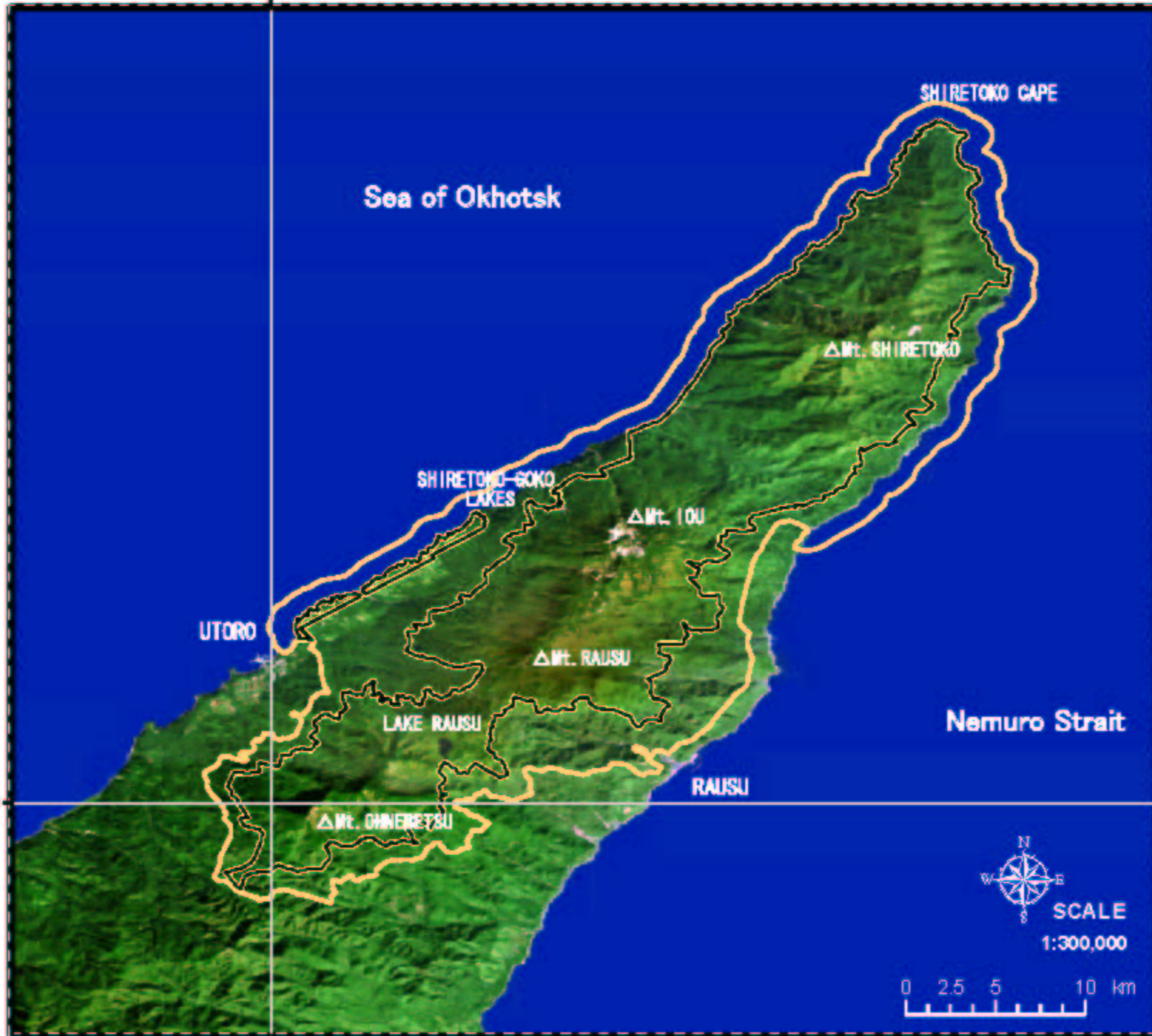
Figure 1-3 Location of the nominated site in Shiretoko Peninsula