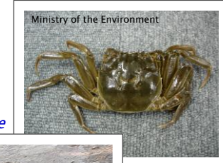
genus Eriocheir ▼