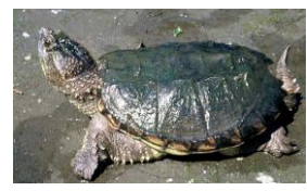
Snapping turtle ▶

The objective of this act is to prevent damages against biodiversity, human safety, or agriculture in Japan caused by invasive alien species.