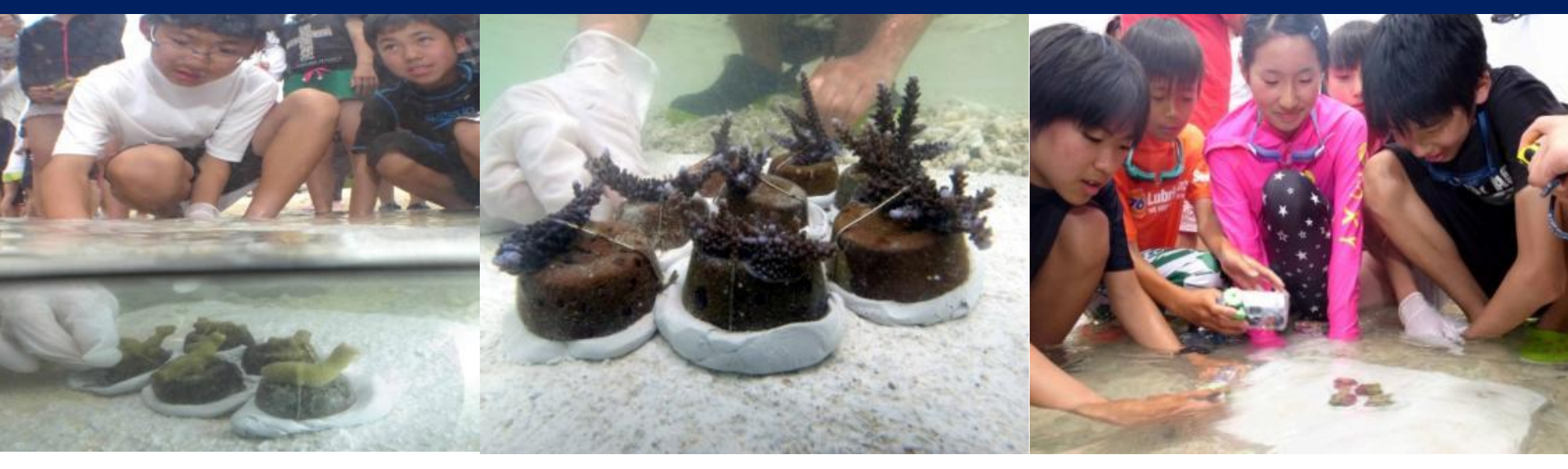
School excursion students and other visitors at NOYFC