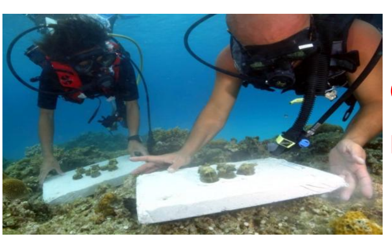
Coral Transplanting Environment Education