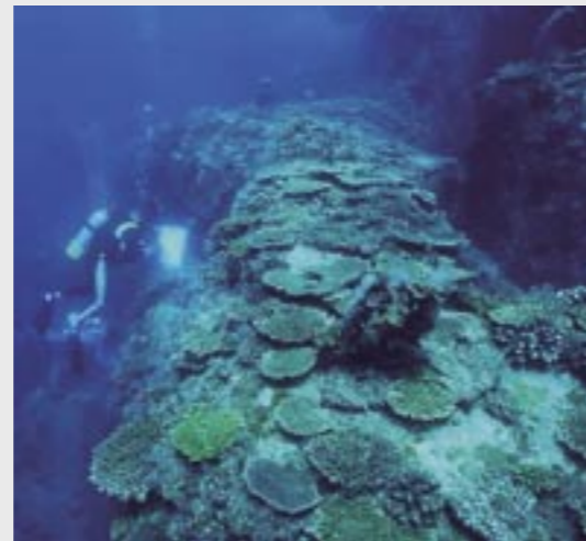
Photo. 1. A coral community developing on the breakwater of Naha Harbor, Okinawa.

Rich Acropora communities were reportedly developing along the coast of Naha Airport until the 1998 bleaching event. On the breakwaters of Naha Harbor, located adjacent to the airport, it has been observed that many coral colonies are proliferating (Photo. 1). These areas have the potential to foster the healthy growth of coral communities, despite their seemingly unfavorable locations, and thus