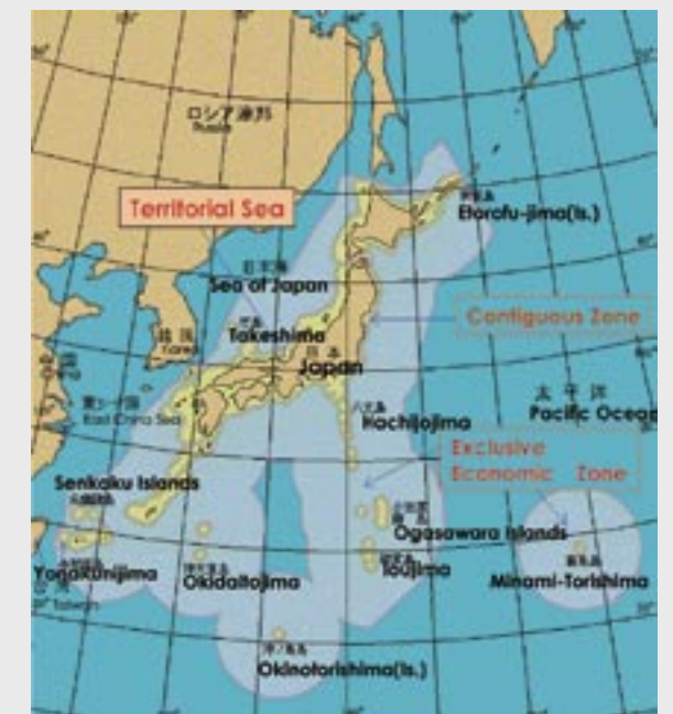
Fig.3. Exclusive Economic Zone of Japan Okinotorishima, a solitary island at the southernmost of Japan, covers larger Economic Zone than the land area of Japan (more than 370,000 km 2 ). Original Map is from Japan Coast Guard's official home page.

Despite their importance in identifying Japan's territorial boundaries, there is little information on how these reefs formed and on the present status of the reefs. The islands on the table reefs of Minamitorishima and Okinotorishima are either remnant limestone deposits and/or consolidated bioclastics. To preserve these islands and protect them from storms and sea level rise, it is necessary to conduct research on their present status and understand how they were formed, which may in turn lead to eco-technology that elucidates island forming processes.