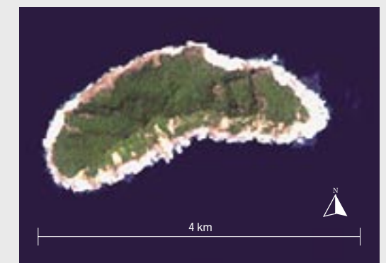
Fig. 4. Satellite image (Landsat ETM+) of Uotsurijima (Is.) in Senkaku Islands.