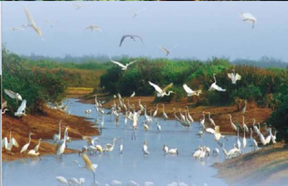
Vietnam is recognized as one of the countries with high biodiversity Different types of ecosystems