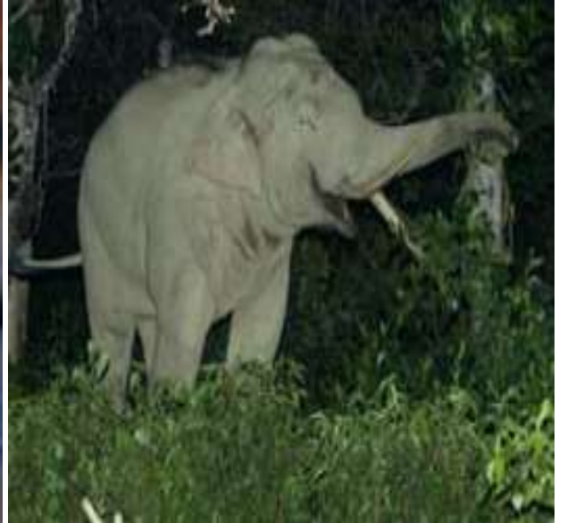
Diversity of species and genetic resources