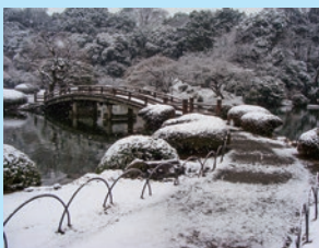
Japanese Traditional Garden

The present site of Shinjuku Gyoen was originally one part of the Edo residence of Lord Naito, a vassal of Ieyasu Tokugawa. In the Meiji era, it became an agricultural experiment station, and then in 1906 it was made into an imperial garden. After the war, in 1949, it was opened to the public as a national garden. The garden contains three styles, Landscape Garden, Formal Garden, and Japanese Traditional Garden, and is considered to be one of the most important modern Western-style gardens of the Meiji era.