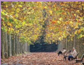
Autumn colors of the sycamore trees

The present site of Shinjuku Gyoen was originally one part of Edo residence of the Lord Naito, the vassal of Ieyasu Tokugawa. In the Meiji era, it became an agricultural experiment station, and then in 1906 it was made into an imperial garden. After the war in 1949, it was opened to the public as a national garden. The garden contains three styles, Landscape Garden, Formal Garden, and Japanese Traditional Garden, and is considered to be one of the most important modern western style gardens in the Meiji era.