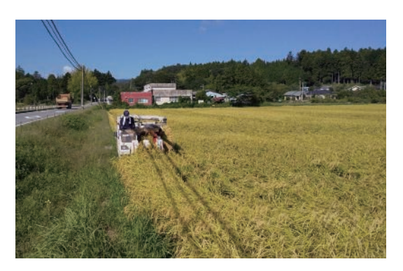
Harvesting rice in Kariyado area, Namie Town.

The harvest was good, and radioactive cesium was not detected in total inspection of rice bags. A member of the organization says: "We would like to increase the cultivation area gradually, and in the future, change our status to an agricultural corporation to play a pivotal role in rice cultivation in this area."