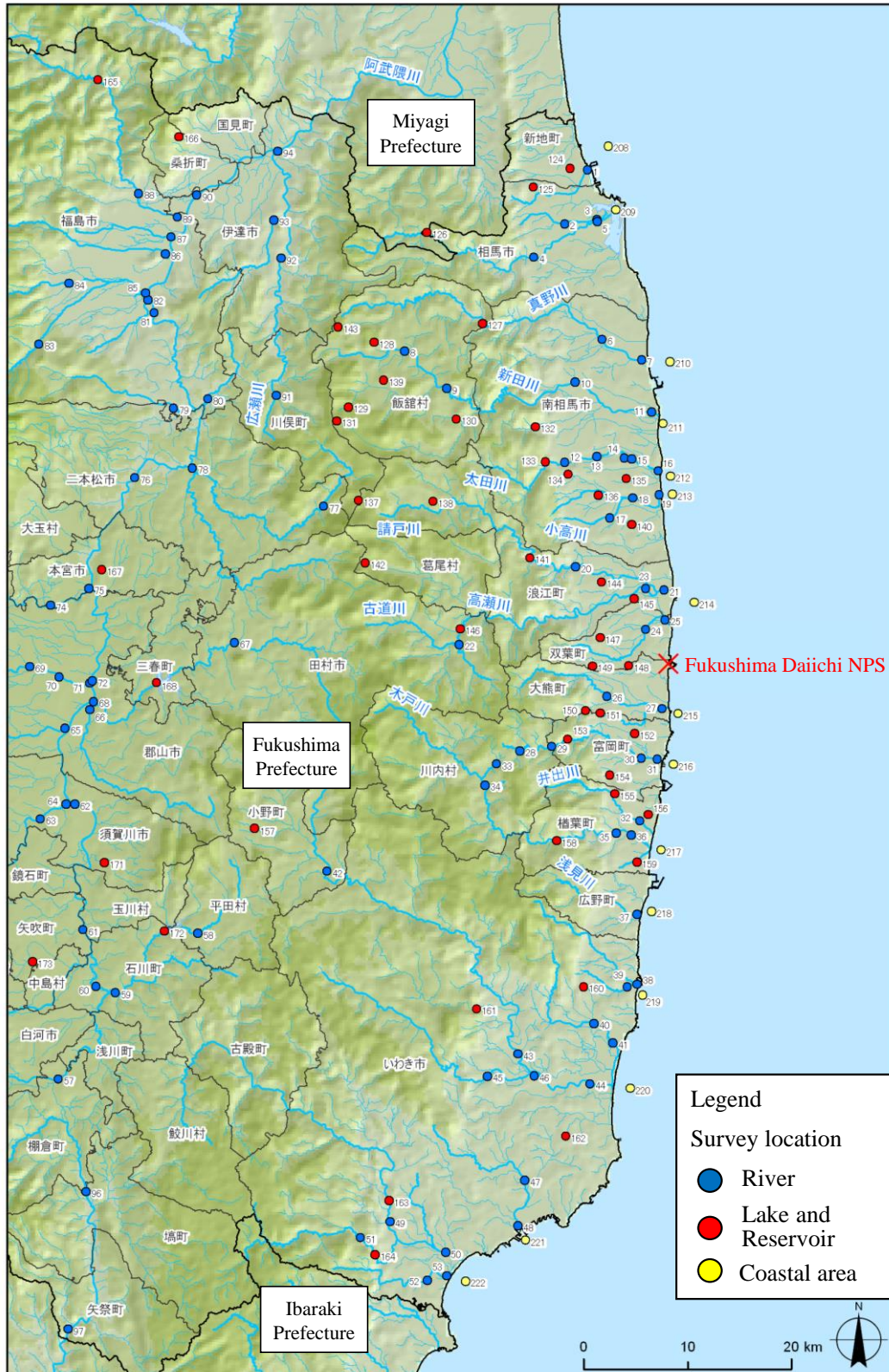
Figure 3.5.4 (1) Survey Locations (Fukushima Prefecture)