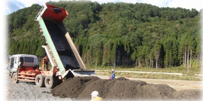
Disaster prevention forests restoration (Settai region, Miyako city, Iwate, started from October, 2012)

Conversion factor (t/m 3 ) : Concrete debris (2.35), Tsunami deposit(1.8) Unit : 10 thousand ton