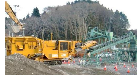
Treatment facility for concrete debris in Yamada town, Iwate (2012.12.11)