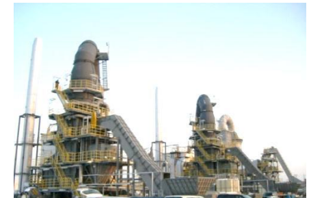
Temporary incinerator in Souma city, Fukushima (2013.1.16)