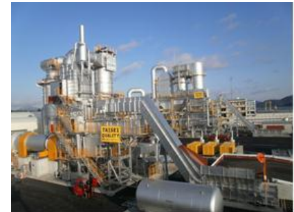
Temporary incinerator in Kesenuma city, Miyagi (2012.12.23)