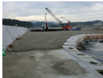
Shizugawa fishing port south-side breakwater restoration work