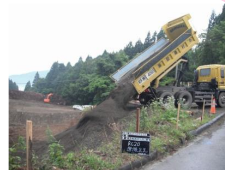
Ofunato-Ayasato-Sanriku line road improvement work